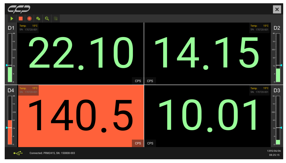
Software main window (Mode 2)