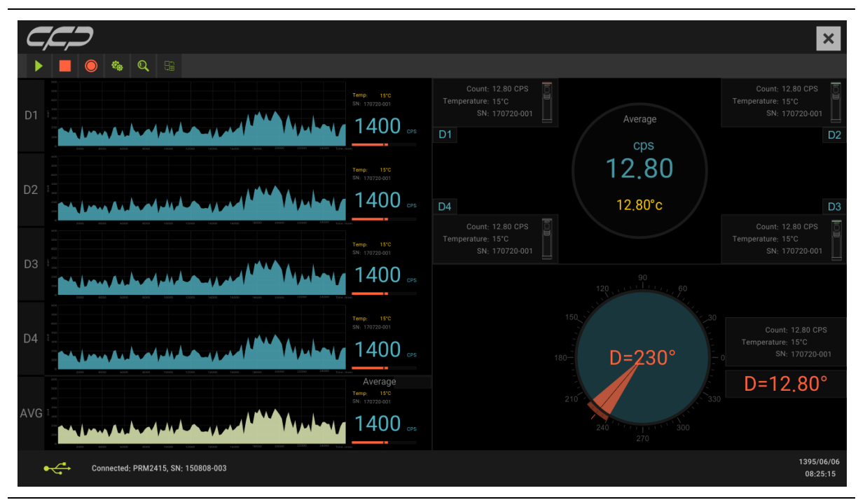
Software main window (Mode 1)