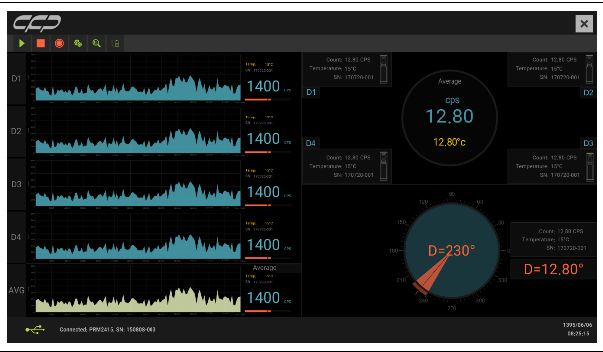
Software main window (Mode 1)

This system can support all probe produced by of CFP Co.