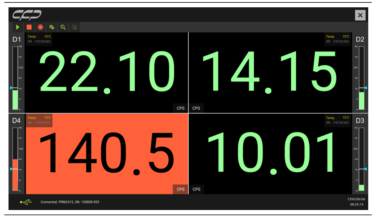
Software main window (Mode 2)