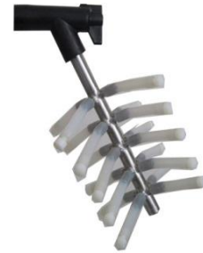
10 Port Manifold Ampoule connector (Option)

Address: Tehran. ayatollah saeeid highway. chahardangeh industrial town. 19 th street. 4 th felztarash. st. NO.24