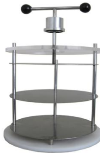
Stoppering Chamber (Option)