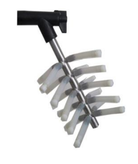
10 Port Manifold Ampoule cannector (Option)

\emph{Address:} Tehran. ayatollah saeeid highway. chahardangeh industrial town, 19^{th} street. 4^{th} felztarash. st.