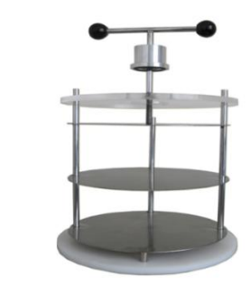
Stoppering Chamber (Option)